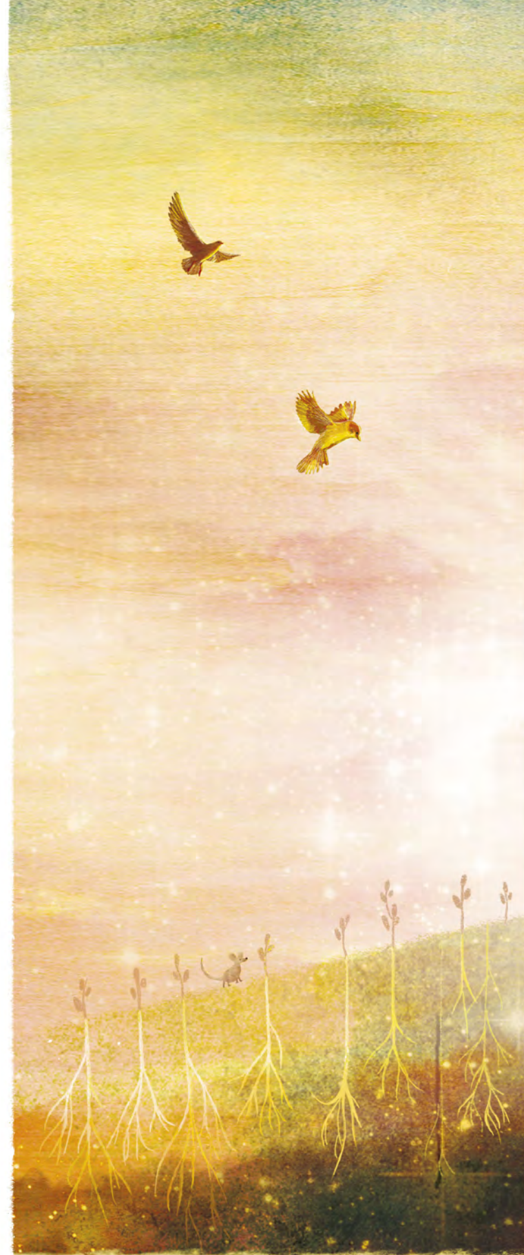
Roots before shoot.