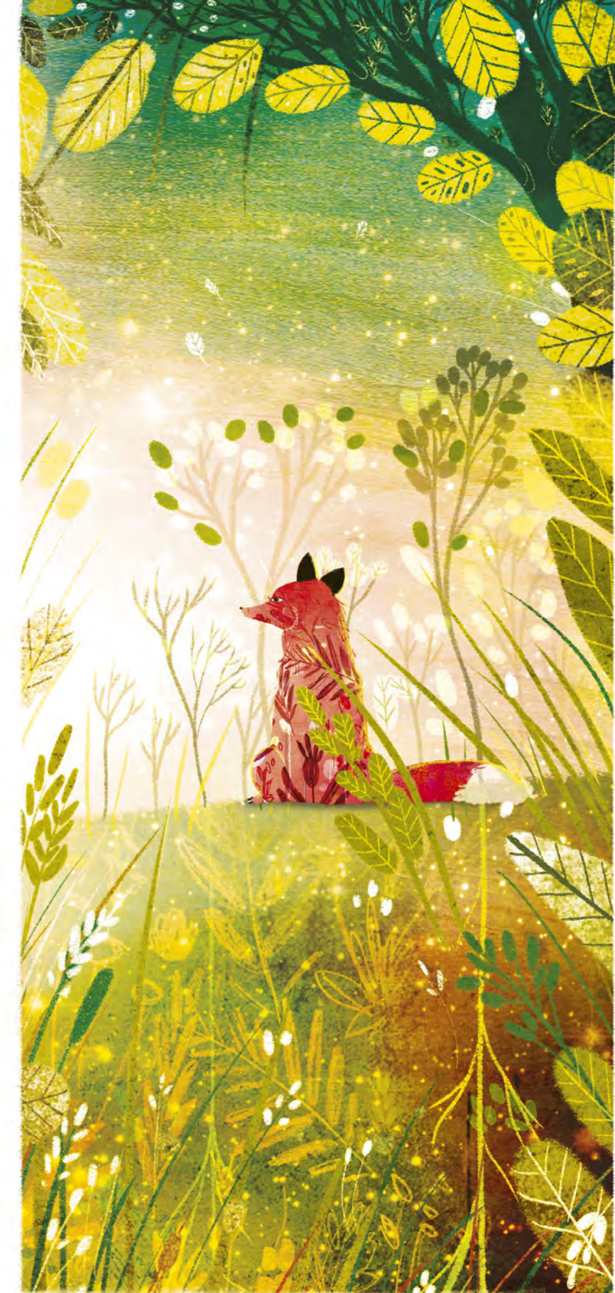
Leaf before fruit.