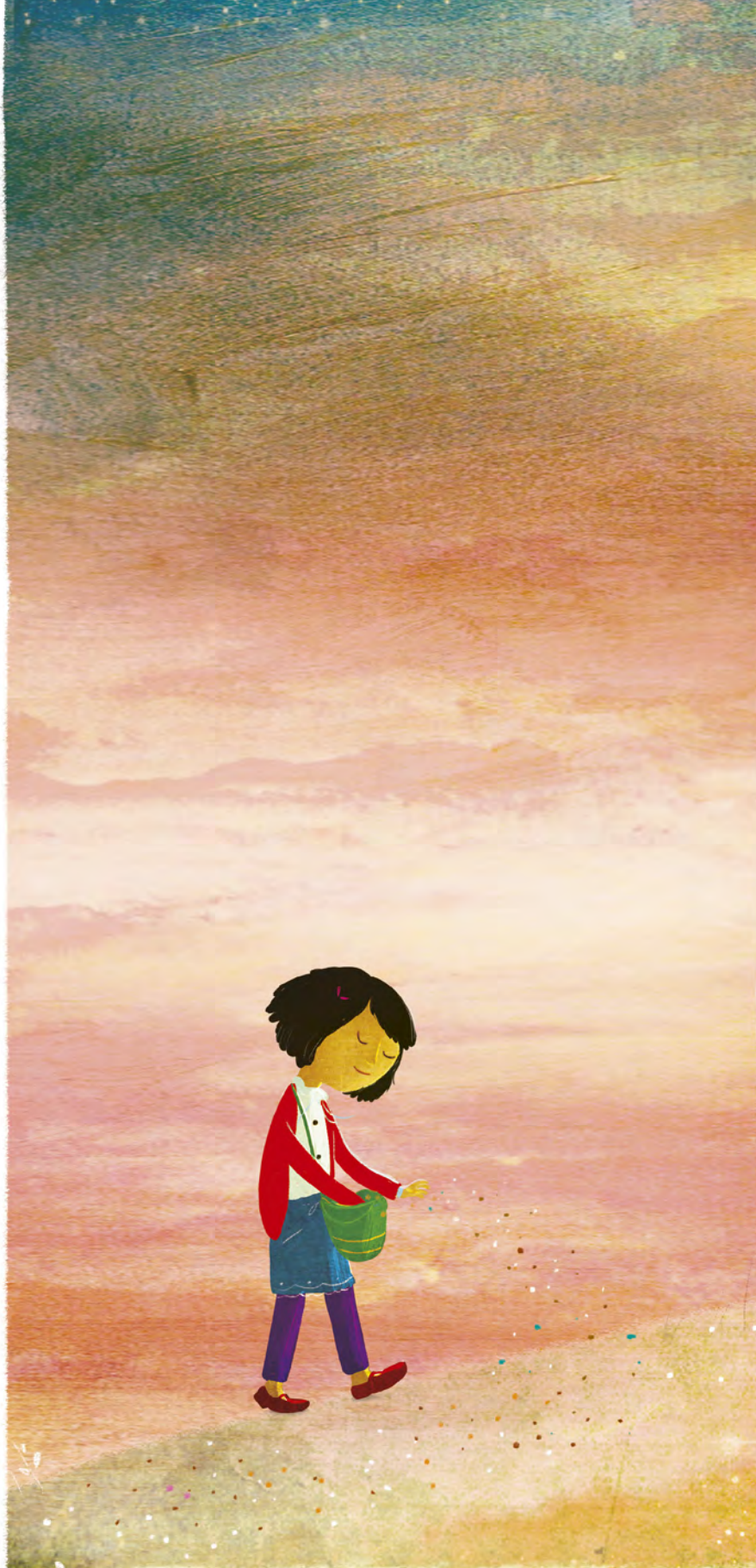
Sowing and planting.